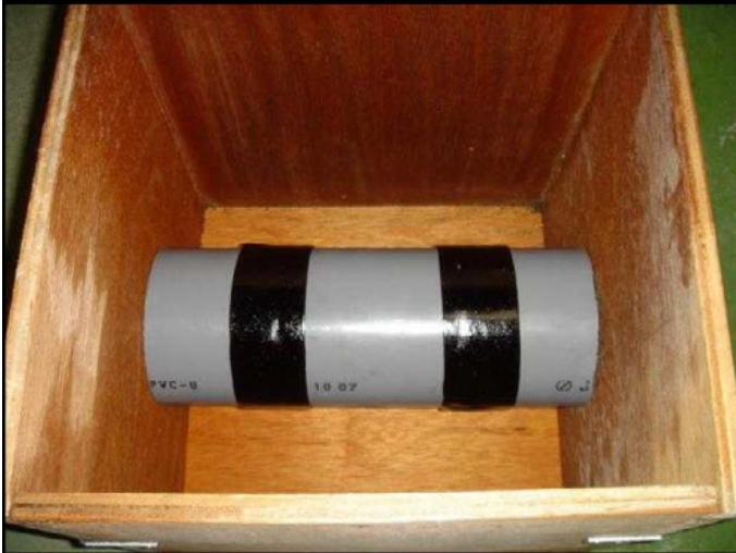
Installation on Steel and PVC pipe